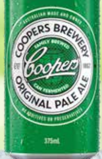
Coopers Pale Ale cans