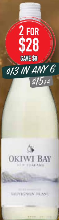
Okiwi Bay Marlborough Sauvignon Blanc RRP $18