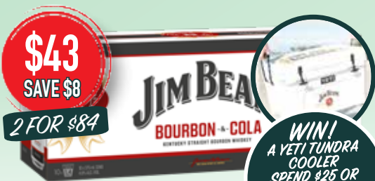
Jim Beam White Label Bourbon & Cola 10 pack cans inc. Zero Sugar RRP $51

WIN! A YETI TUNDRA COOLER SPEND $25 OR MORE ON ANY JIM BEAM PRODUCT & ENTER ONLINE