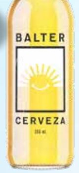
Balter Cerveza stubbies