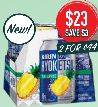
Kirin Hyoketsu Vodka Soda Pineapple 4 packs & varieties RRP $26