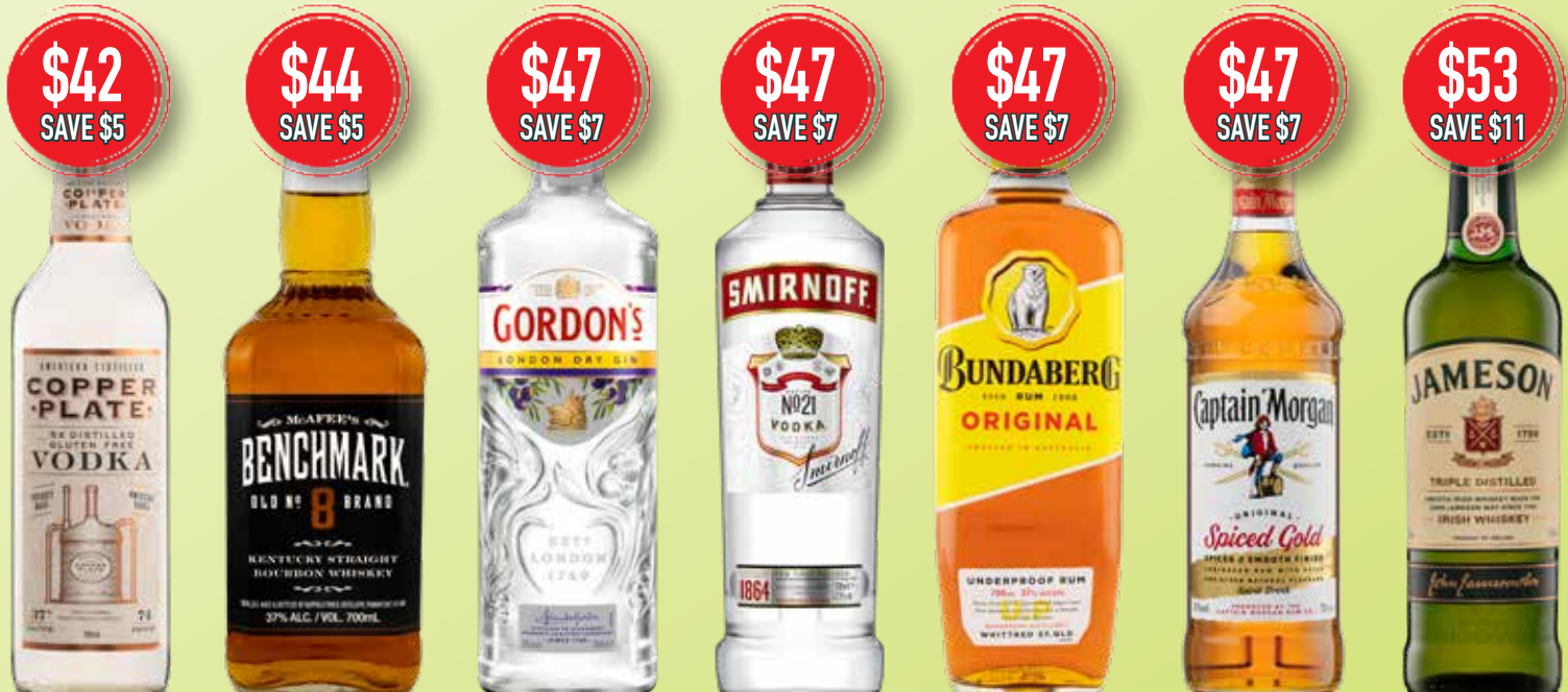
Copper Plate Vodka 700ml RRP $47 Benchmark Bourbon 700ml RRP $49 Gordon's London Dry Gin 700ml RRP $54 Smirnoff Red Label Vodka 700ml RRP $54 Bundaberg Underproof Rum 700ml RRP $54 Captain Morgan Original Spiced Gold 700ml RRP $54 Jameson Blended Irish Whiskey 700ml RRP $64