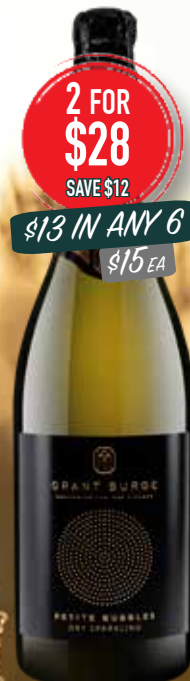
Grant Burge Sparkling Petite Bubbles incl. Sparkling Rosé RRP $20