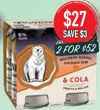
Bundaberg Campfire Bourbon Barrel Rum & Cola 4 pack cans RRP $30