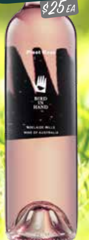
Bird in Hand Pinot Rosé (includes, Sauvignon Blanc, Sparkling & Bush Shiraz) RRP $29