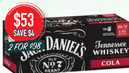
Jack Daniel's & Cola 10 pack cans inc. Zero Sugar RRP $57