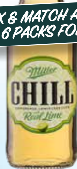
Miller Chill with Lime Lager stubbies