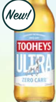
Tooheys Ultra Zero Carb stubbies