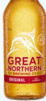
Great Northern Original stubbies