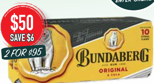
Bundaberg Rum & Cola 10 pack cans inc. Bare & Red RRP $56