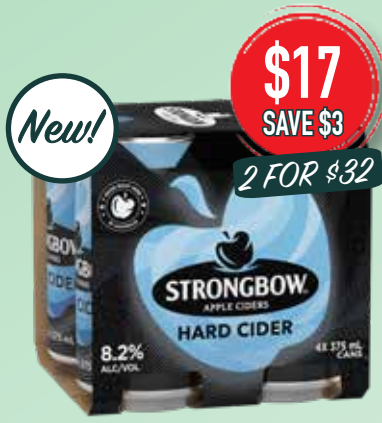
Strongbow Hard Apple Cider 8.2% 4 pack cans RRP $20