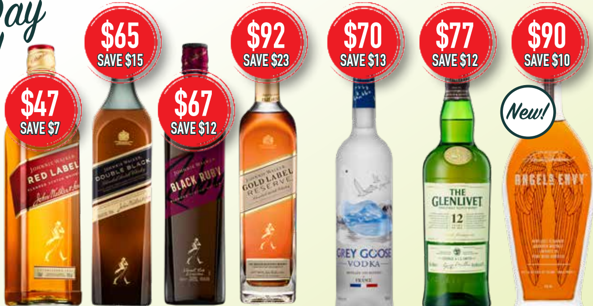
Johnnie Walker Red Label Blended Scotch Whisky 700ml RRP $54 Johnnie Walker Double Black Blended Scotch Whisky 700ml RRP $80 Johnnie Walker Black Ruby Blended Scotch Whisky 700ml RRP $79 Johnnie Walker Gold Label Reserve Blended Scotch Whisky 700ml RRP $115 Grey Goose Original Vodka 700ml RRP $83 Glenlivet 12yr Old Single Malt Scotch Whisky 700ml RRP $89 Angels Envy Bourbon 750ml RRP $100

Celebrate the Legends of Dad Jokes & Lawn Care!