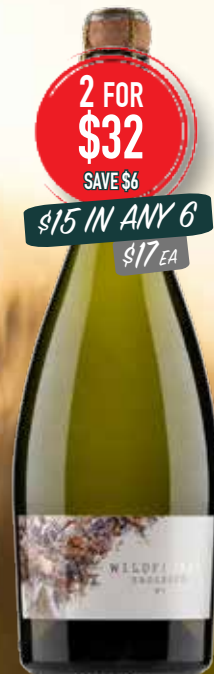
Wild Flower Prosecco & varieties RRP $19