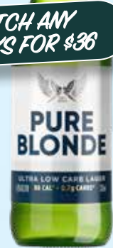
Pure Blonde stubbies