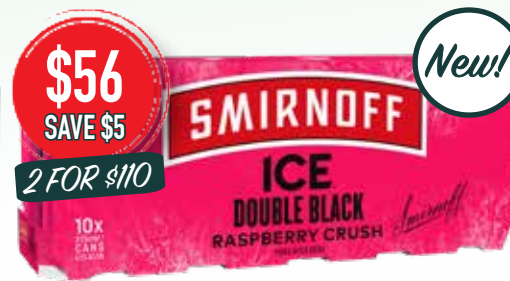
Smirnoff Double Black Raspberry Crush 10 pack cans RRP $61