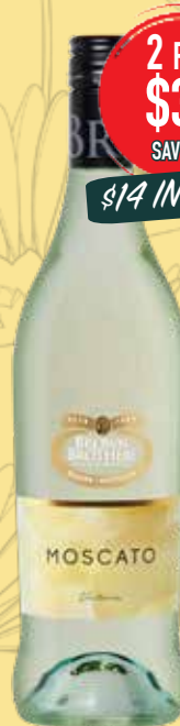
Brown Brothers Moscato & Moscato varieties RRP $17