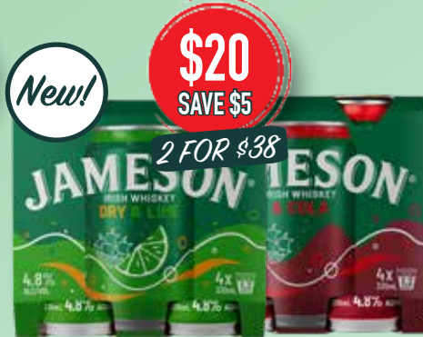
Jameson Dry & Lime 4.8% 4 pack cans inc. Cola RRP $25