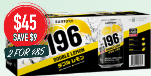
-196 Suntory Double Lemon 10 pack cans inc. Peach & Grape RRP $54