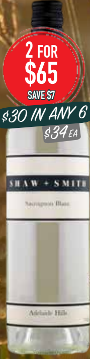
Shaw & Smith Sauvignon Blanc RRP $36