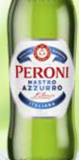
Peroni Nastro Azzurro stubbies