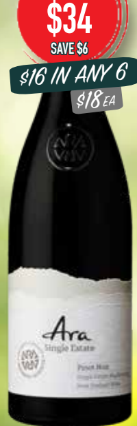
Ara Single Estate Pinot Noir & varieties RRP $20