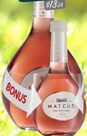
Mateus Rosé - Kangaroo Pack RRP $17