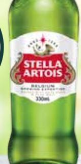
Stella Artois stubbies