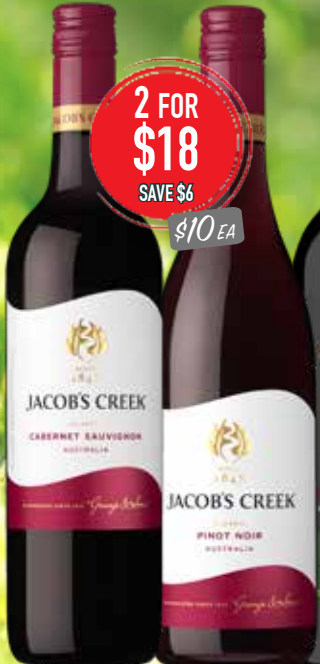
Jacob's Creek Classic Cabernet Sauvignon & varieties RRP $12