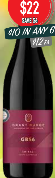
Grant Burge GB56 Shiraz & varieties RRP $14