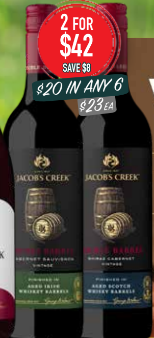
Jacob's Creek Double Barrel Shiraz & varieties RRP $25