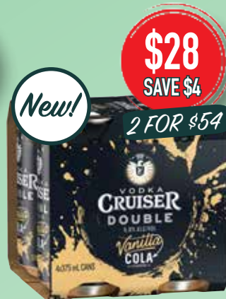
Cruiser Double Vanilla Cola 4 pack cans & varieties RRP $32