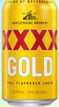
XXXX Gold 30 Block cans