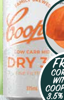
Coopers Dry 3.5 cans

FREE! CORD CAP WITH ANY COOPERS DRY 3.5% CARTON PURCHASE