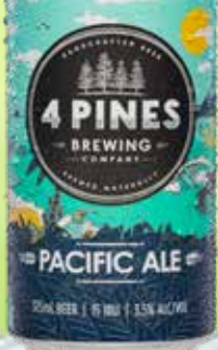
4 Pines Pacific Ale cans