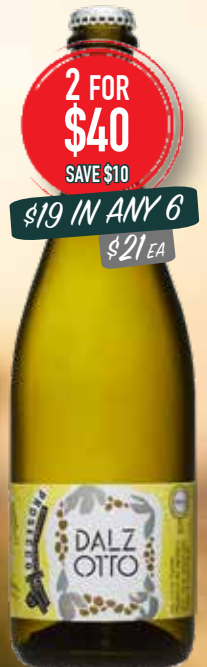
Dal Zotto Prosecco incl. Rosato & Pinot Grigio RRP $25