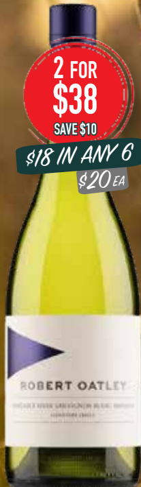
Robert Oatley Signature Series SSB & varieties RRP $24