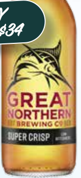
Great Northern Super Crisp stubbies