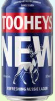
Tooheys New 30 Block cans