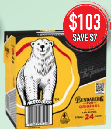
Bundaberg U.P. Rum & Cola Cubes 24PK Inc. Bundy Red & Johnnie Walker RRP $110