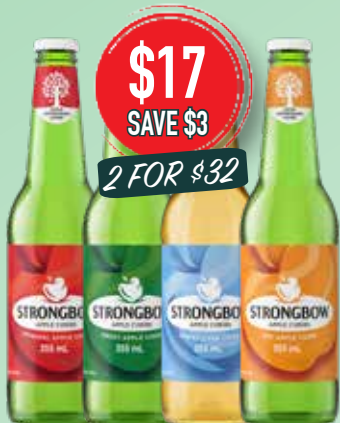
Strongbow Original Apple Cider 6 pack Inc. Dry, Sweet & Low Carb RRP $20