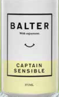
Balter Captain Sensible cans