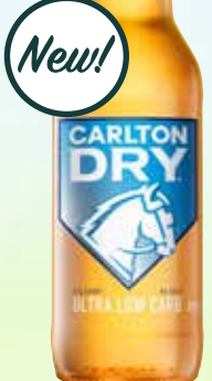
Carlton Dry Ultra Low Carb stubbies