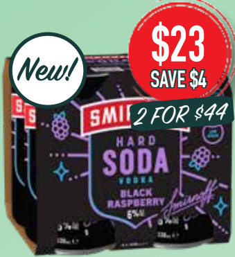
Smirnoff Hard Soda Black Raspberry Low Sugar 6% 4 pack cans inc. Yuzu RRP $27