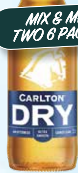
Carlton Dry stubbies