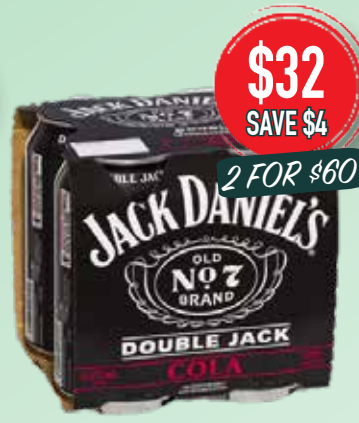
Jack Daniel's Double Jack & Cola 4 pack cans inc. No Sugar RRP $36