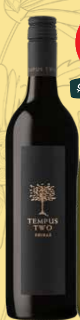
Tempus Two Chardonnay & varieties RRP $16