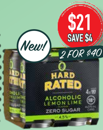
Hard Rated Lemon Lime Zero Sugar 4 pack cans inc. Lemon & Lemon Zero Sugar RRP $25