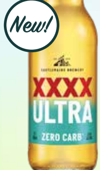
XXXX Ultra Zero Carb stubbies