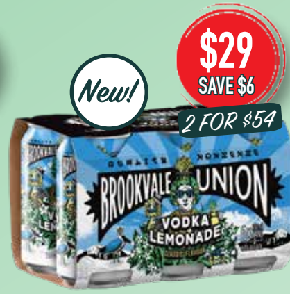
Brookvale Union Vodka Lemonade 6 pack cans & varieties RRP $35