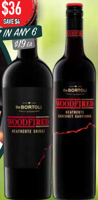
De Bortoli Woodfired Shiraz & varieties RRP $20