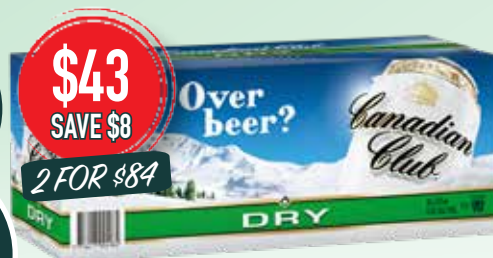
Canadian Club Whisky & Dry 4.8% 10 pack cans inc. Zero Sugar, Cola & Soda & Lime RRP $51

WIN! A YETI TUNDRA COOLER SPEND $25 OR MORE ON ANY JIM BEAM PRODUCT & ENTER ONLINE