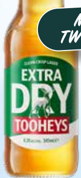
Extra Dry stubbies