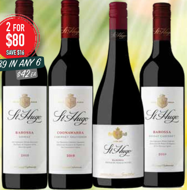
St Hugo Shiraz & varieties RRP $48